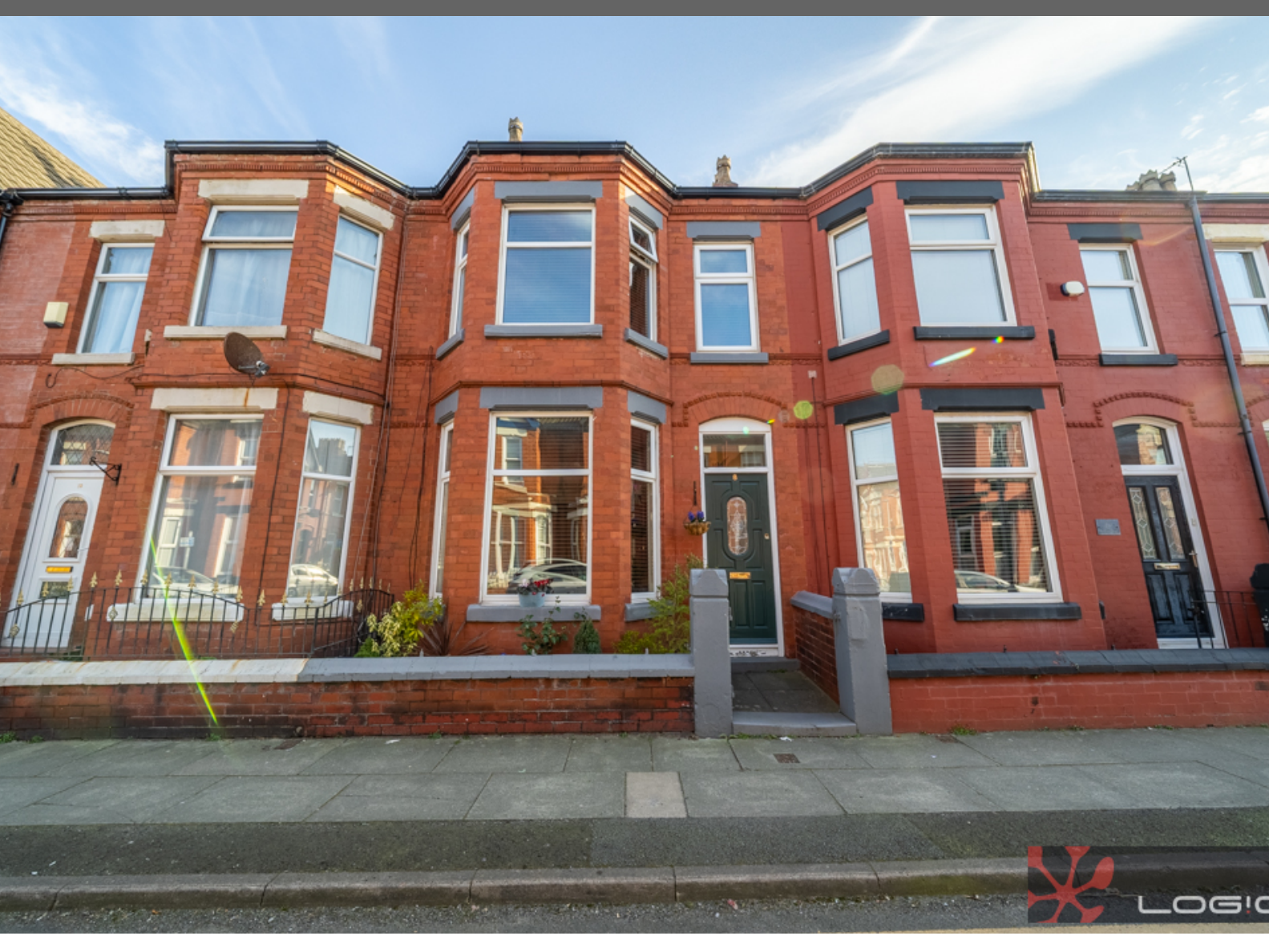
* Three bedroom mid terraced house *Freehold *Sought after road *Two separate reception rooms *Fitted kitchen and separate utility room *Three double Bedrooms