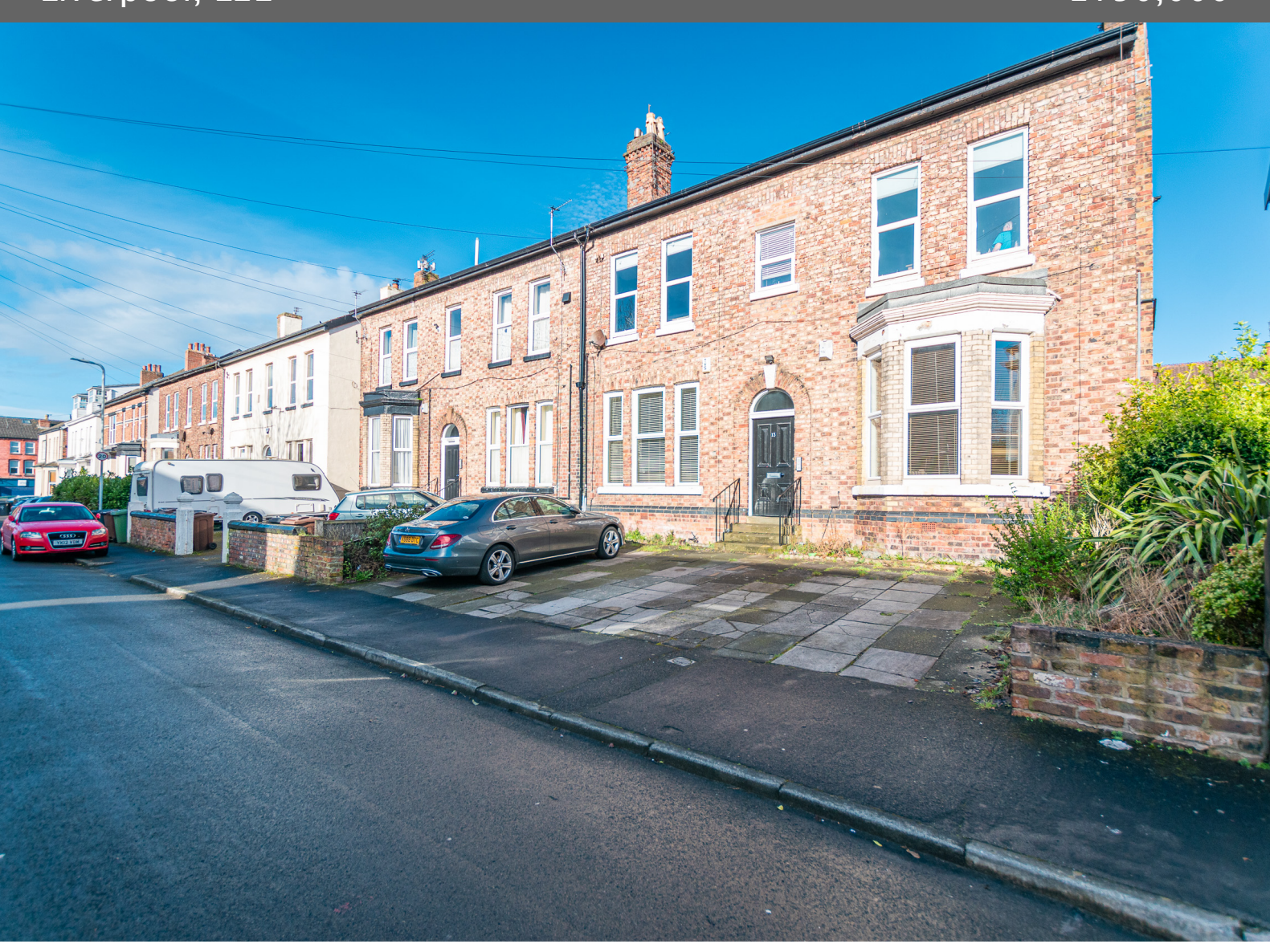
*Ground Floor Apartment *0.5m From Crosby Beach *Private Garden *Off Road Parking *Well Presented Throughout *Excellent Transport Links