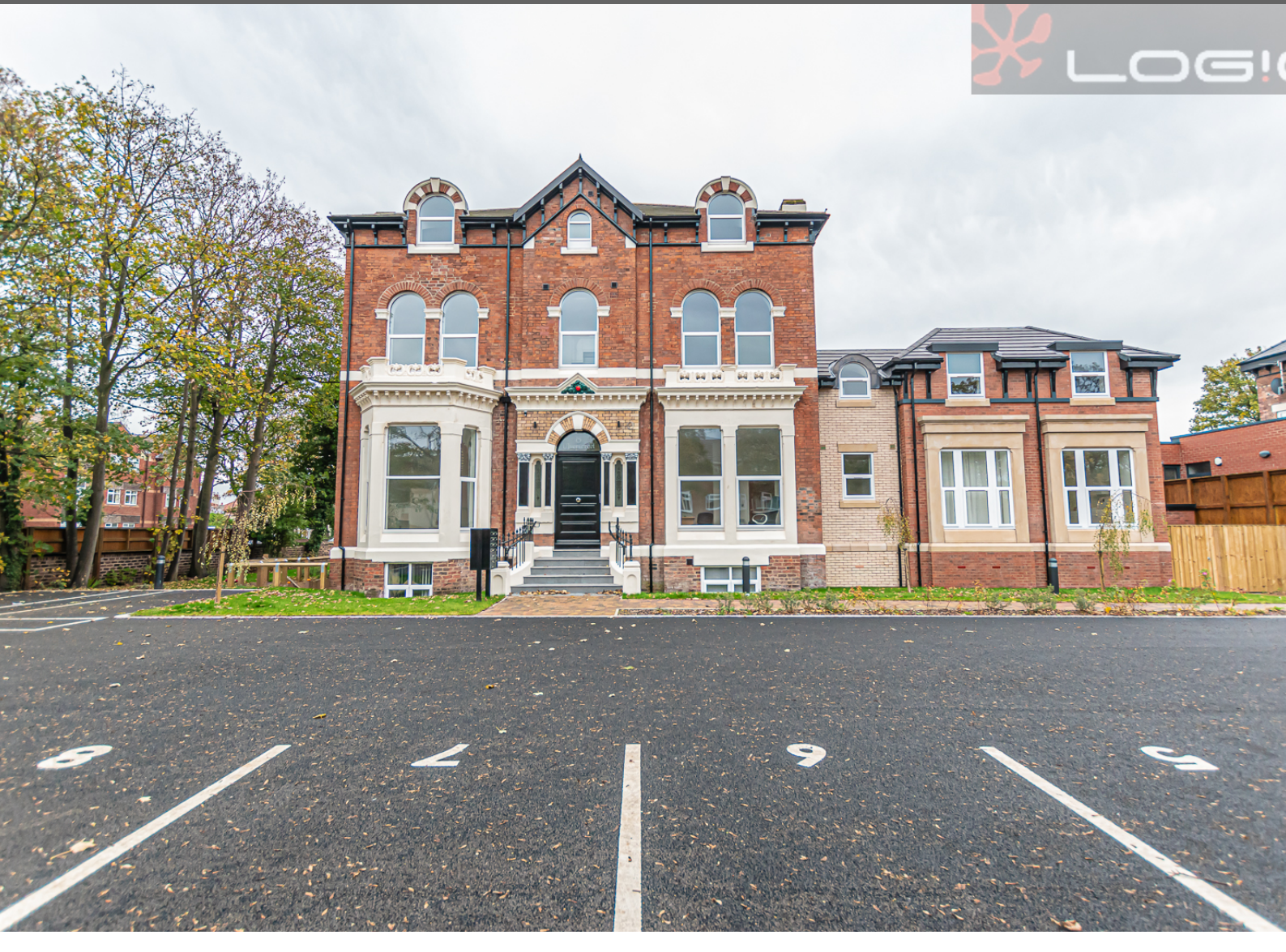
*First Floor *Studio Apartment * 37m2 / 398 sq.ft *Allocated Parking