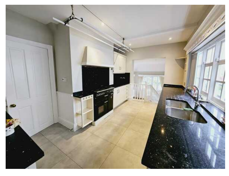
Dreamview Estates give notice to anyone reading these particulars that: (i) these particulars do not constitute part of an offer or contract; (ii) these particulars and any pictures or plans represent the opinion of the author and are given in good faith for guidance only and must not be construed as statements of fact; (iii) nothing in the particulars shall be deemed a statement that the property is in good condition otherwise; we have not carried out a structural survey of the property and have not tested the services, appliances or specified fittings.