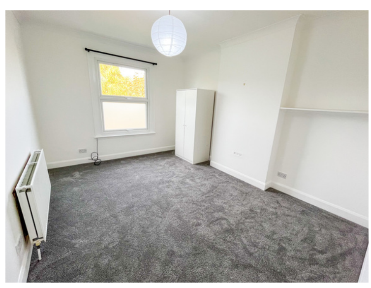
Dreamview Estates give notice to anyone reading these particulars that: (i) these particulars do not constitute part of an offer or contract; (ii) these particulars and any pictures or plans represent the opinion of the author and are given in good faith for guidance only and must not be construed as statements of fact; (iii) nothing in the particulars shall be deemed a statement that the property is in good condition otherwise; we have not carried out a structural survey of the property and have not tested the services, appliances or specified fittings.