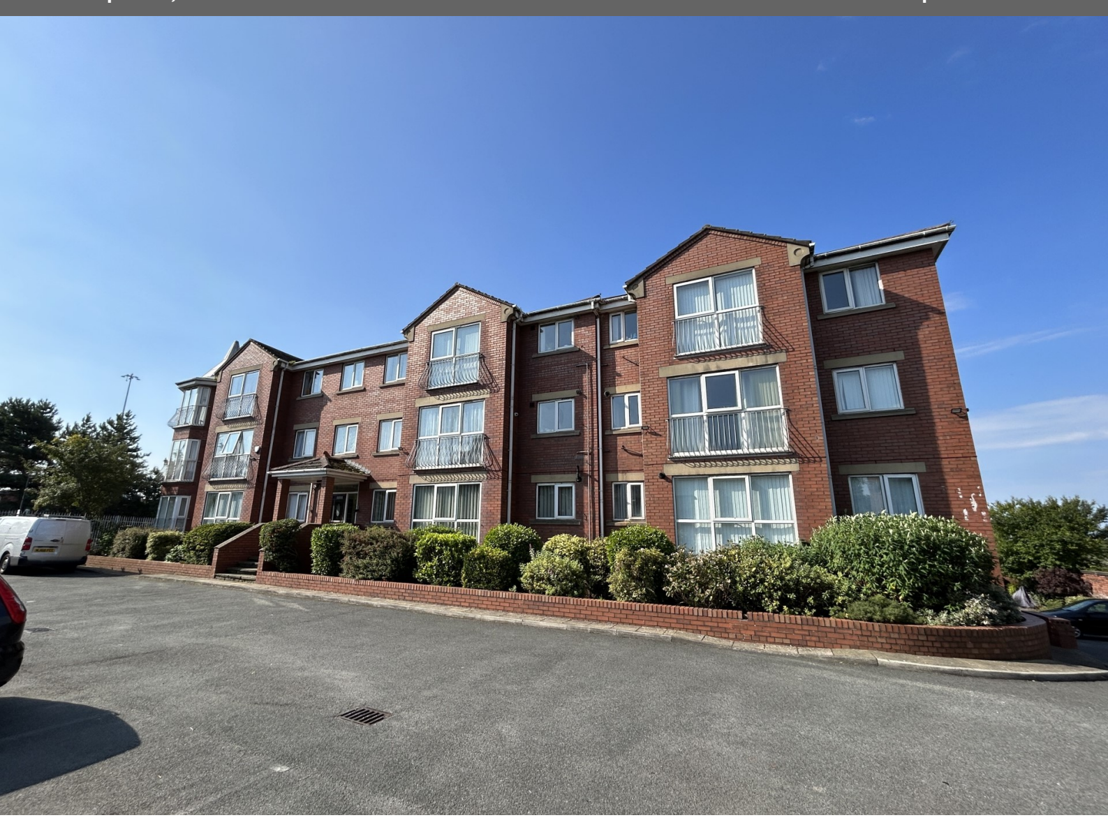
*First Floor Flat *Stunning Sea Views *Recently and Neutrally Redecorated *Two Bedrooms *Welcoming and Bright Reception Area *Large Balcony with Fantastic Views